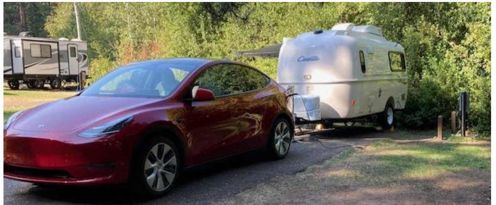
Anne and Randy Brooks of Plug In NCW powered their Model Y and their Casita trailer at an RV campground site.

Our friends Plug-In North Central Washington have some advice here .